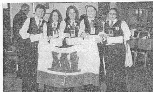
Successful ladies display our flag.

The Ladies team also won their Consolation Tournament, beating Northern Ireland in the final. Further details when these become available.